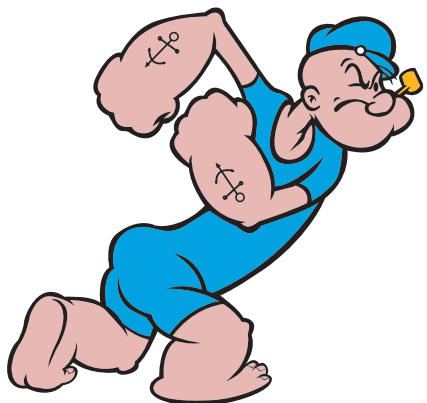
Original Vector Image