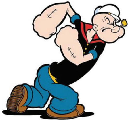
Original Pixel-Based Raster Image