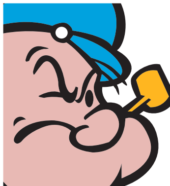
Image enlarged to reveal smooth edges