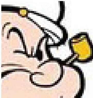
Image enlarged to reveal jagged pixels